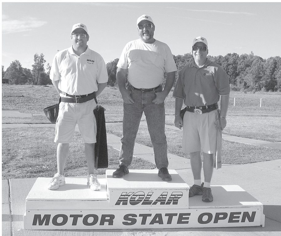
20 Gauge winners.