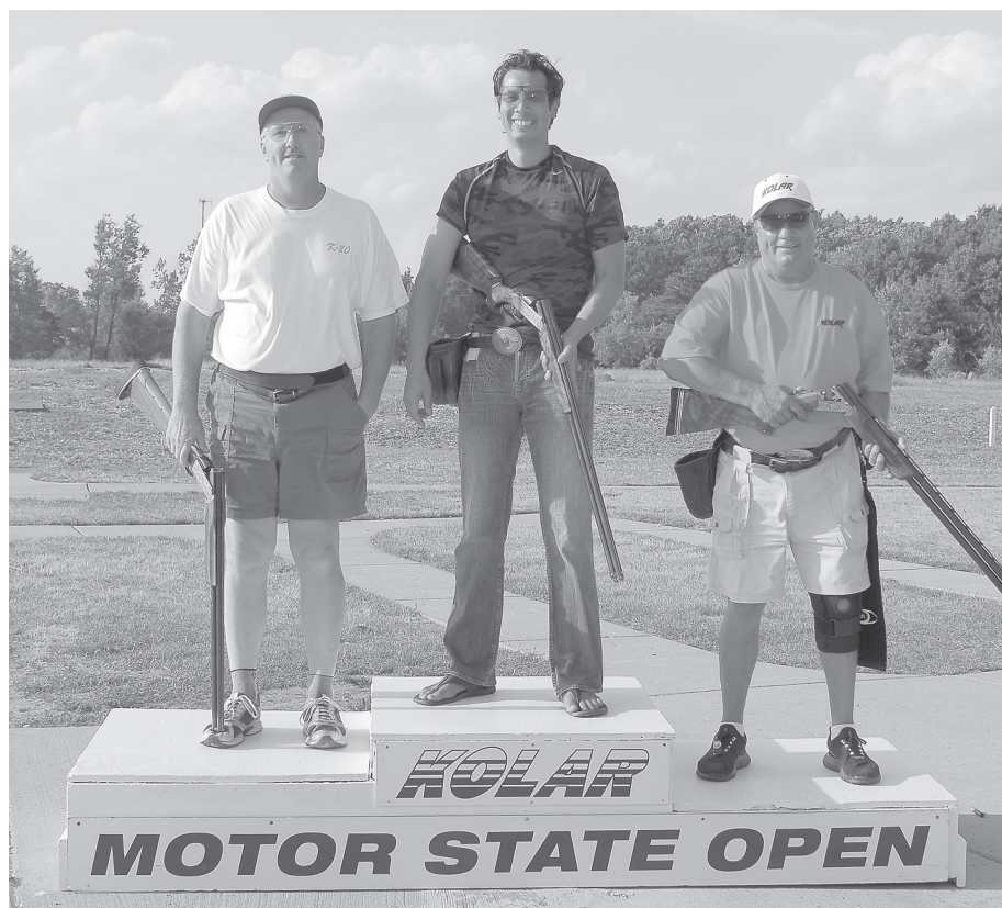
28 Gauge winners.