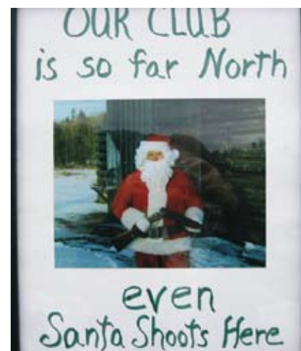
How far is Negaunee?