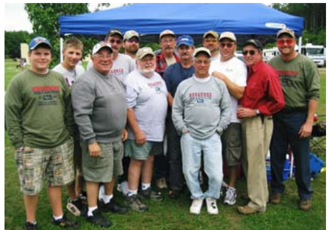
Yoopers - All! Glad to have you with us.