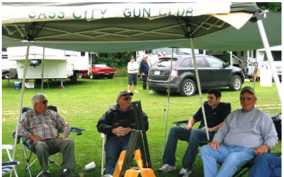
Cass City Boys