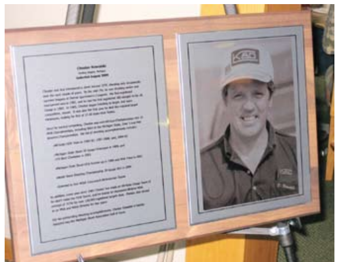
Chester's Hall of Fame Plaque.