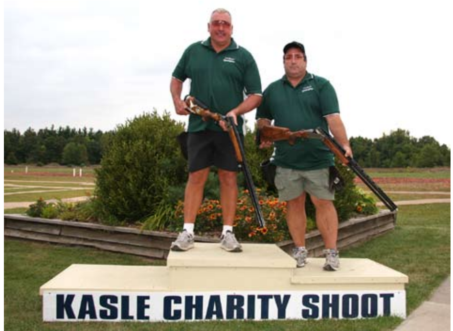
20 Gauge winners.