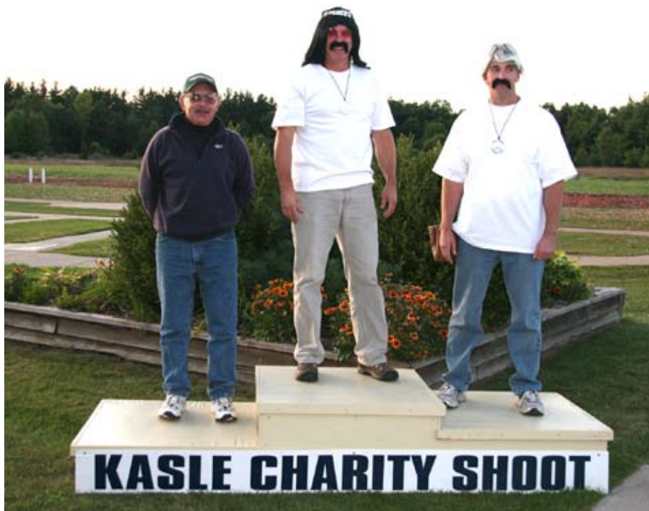
28 Gauge winners.