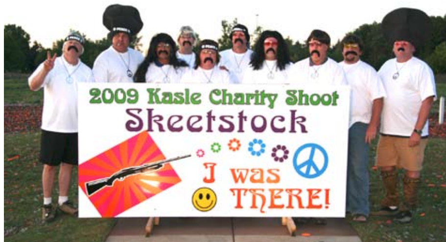
Best - Kastle Cup Shooters