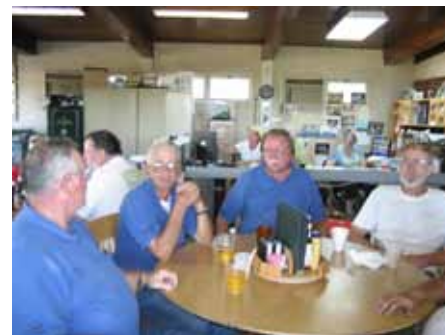
Cass City Boys.