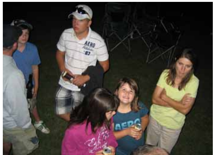
The Juniors like to hang too!