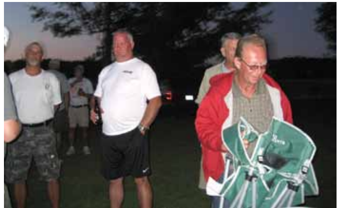
Hanging with the campers.