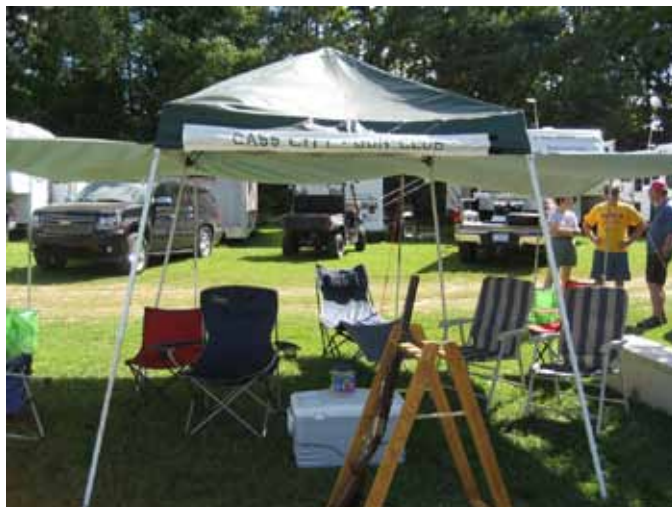
Went visiting and no one was home!