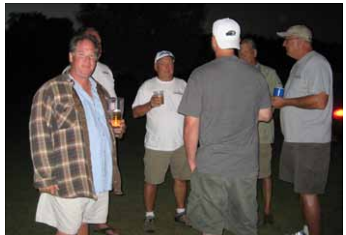
More Fun Folks!