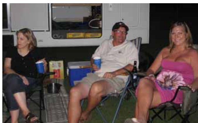
Hanging out after the ceremonies.