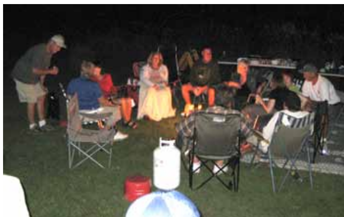
Huddled around the campfire! -- lots of fun!