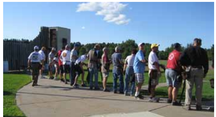
Everyone wanted to shoot Gordon's Hat.