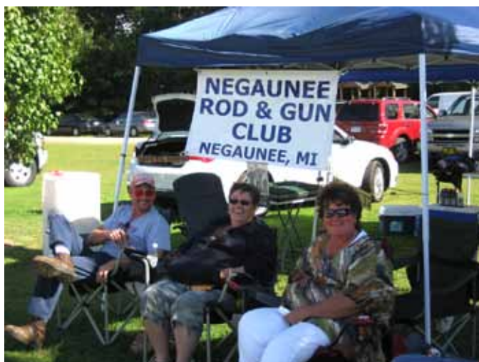
Happy Group -- Aren't They?