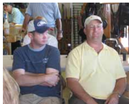
The guys gather around for the Awards.