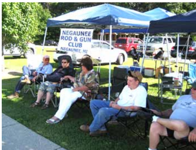
But .... The Yoopers were home!!