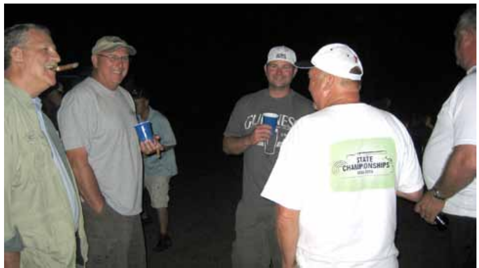
Lots of Brewsky going around!