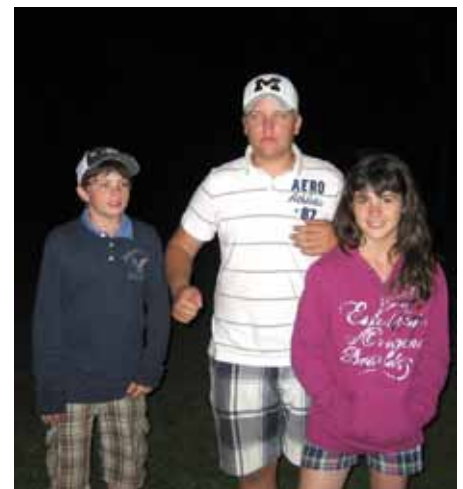
Hey -- shouldn't you guys be in bed?