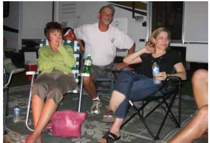
More Fun Folks!